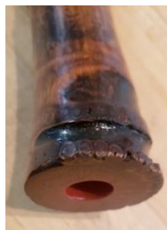
Root-end, urushi lacquer