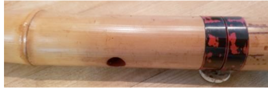
Thumbhole and hozo