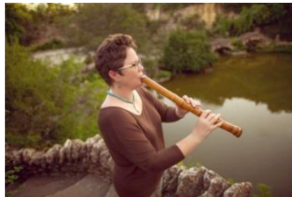
Posture while standing